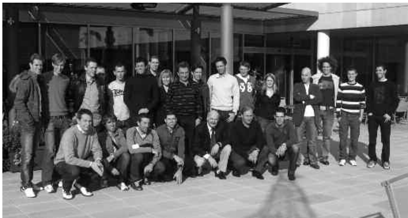
Participants in the Rider's Meeting on Social Dialogue in the Professional Cycling Sector in Barcelona, Spain, 18 and 19 December 2008