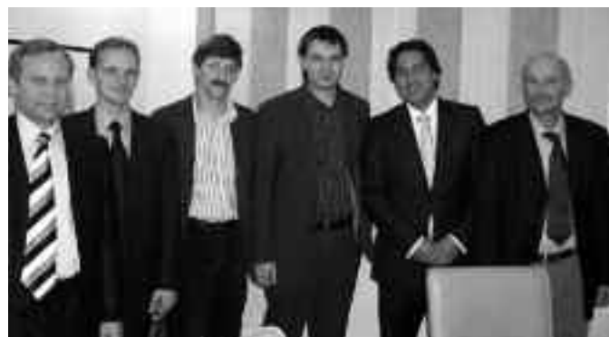
Round Table on the Status of Football Players and the FIFA Rules, organized by Legal League Football Lawyers association in Donetsk, Ukraine, 14 November 2008, with the participation of representatives of Legal League, CIC Group, The T.M.C. Asser Institute, Spartak Moscow and Ruben Kazan

Mr President, unless I can help you with anything further, this concludes my submission.