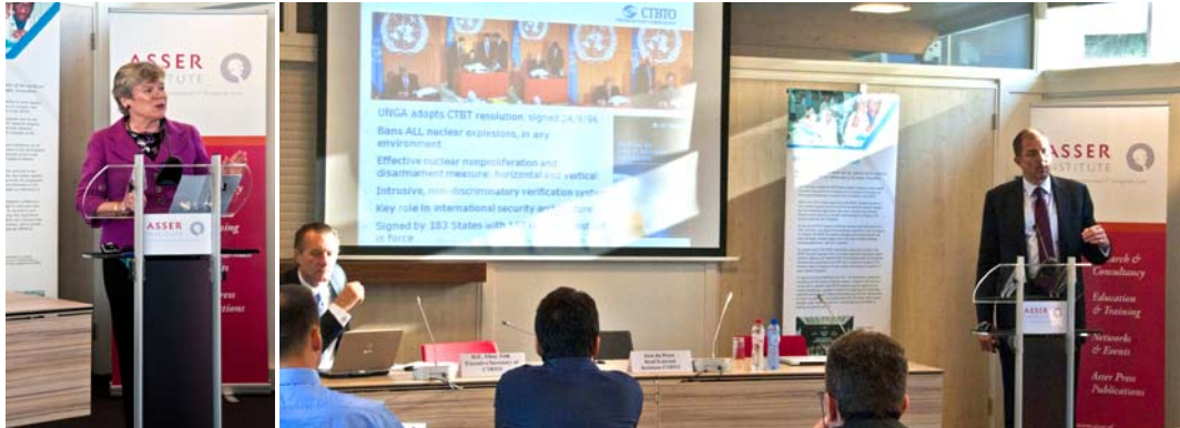
Rose Gottemoeler at the Third Annual Summer Programme on 'Disarmament & Non-Proliferation of Weapons of Mass Destruction in a Changing World', September 2012