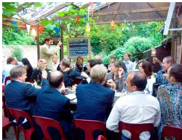
Participants of the postgraduate course in International Trade and Business Law and the staff of the T.M.C. Asser Instituut at dinner after graduation.