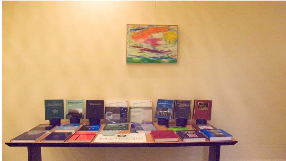
A presentation of the latest publications by T.M.C. Asser Press