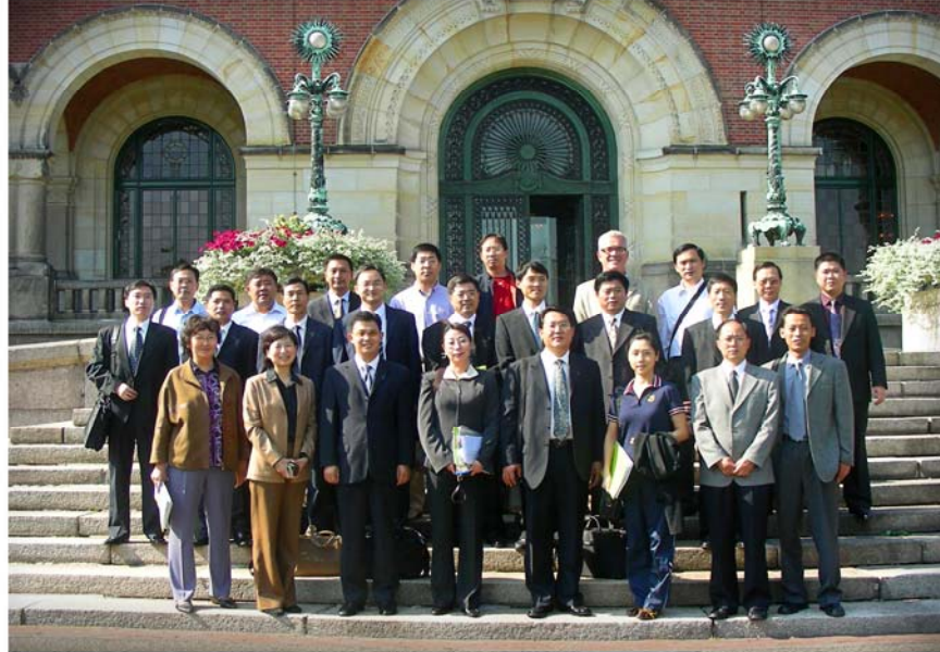
International Criminal Law a course for Chinese judges 11 September - 20 September 2006