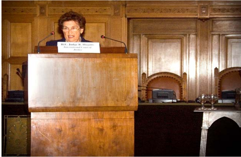
H.E. Judge R. Higgins President of the International Court of Justice was the keynote speaker at the Symposium 'Forty years of International Law' on the occasion of the 40 th anniversary of the T.M.C. Asser Instituut, 28 September 2006.