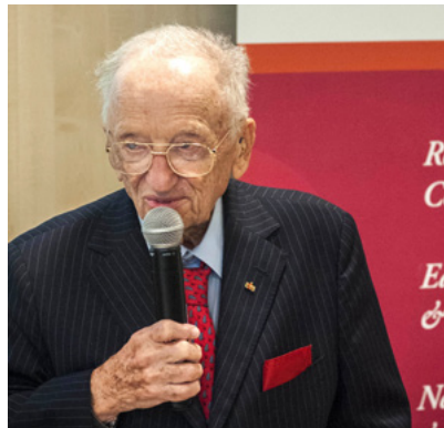
Mr. Benjamin Ferencz, Former Nuremberg Prosecutor

It was a great honour for the institute to welcome Mr. Benjamin Ferencz, the only surviving Nuremberg war crimes prosecutor to deliver the first Supranational Criminal Law (SCL) lecture of the autumn series. Mr. Ferencz, who served