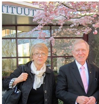
Judge Michael Kirby, Australia's former Justice of the High Court and chairman of the UN Commission of Inquiry on Human Rights in the DPRK

The Asser Institute was privileged to welcome the Honorable Michael Kirby to The Hague for the first discussions of his Commission's report in the presence of practitioners, academics, and representatives of NGOs. Judge Kirby's Commission was mandated by the United Nations Human Rights Council, to investigate the systematic, widespread and grave violations of human rights in the DPRK with a view to ensuring full accountability, in particular for violations which may amount to crimes against humanity. The meeting at Asser examined the possibilities