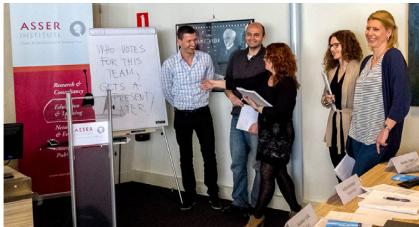
Participants of the Matra PATROL training programme presenting during the Debating & Presentation Skills Workshop

in The Hague, within the framework of the 4-year Matra PATROL training programme (2012-2015).