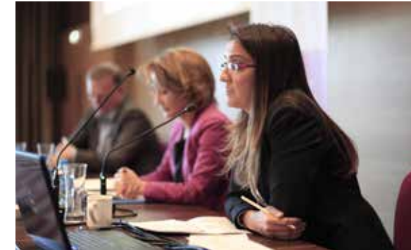
R: Mr Ard van der Steur, Minister of Security and Justice of the Kingdom of The Netherlands