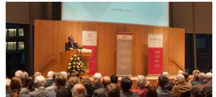
Inaugural T.M.C. Asser Lecture, 2 December 2015, at the Peace Palace

The Annual T.M.C. Asser Lecture invites distinguished international lawyers to take inspiration from Asser's idea of cultivating trust and respect through law and legal institutions, and to examine what it could mean in their area of expertise today.