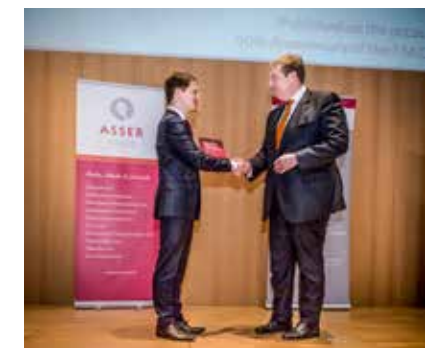
Dr Christophe Paulussen presenting the first copy of the Asser Jubilee book to Mr Ard van der Steur, Minister of Security and Justice of the Kingdom of The Netherlands

A detailed list of all T.M.C. Asser Press publications in 2015 can be found in the online Appendix 'T.M.C. Asser Press Publications' at www.asser.nl/annualreport2015 .