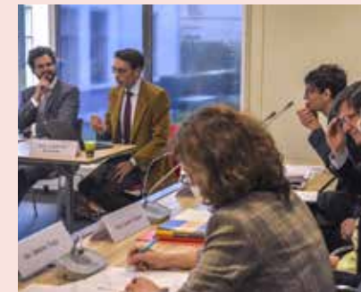
Speakers at the Public Roundtable “In Whose Name? On the Functions, Authority and Legitimacy of International Adjudication”

For a complete overview of the Asser research output in 2015, see the online Appendix ‘Research Publications, Presentations and Outreach’ at www.asser.nl/annualreport2015 .