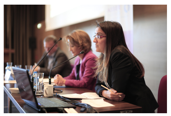
Participant at the roundtable discussion in Ankara, Turkey, 7 November 2014

Since 2012, the Asser Institute, together with its two partner organisations, Ecorys Academy and the Hague Academy for Local Governance , have been delivering a series of trainings in the Hague on areas that will serve to strengthen the rule of law and public administration in the pre-accession countries. This Matra Patrol programme, sponsored by the Netherlands Ministry of Foreign Affairs, aims to promote institutional capacity-building in the field of the rule of law within government organisations in the